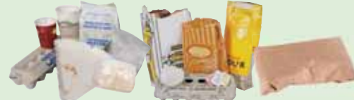
Soiled paper food packaging, cardboard egg cartons, pizza liners, paper plates, paper take-out food trays & containers, parchment paper, tissue paper, meat/fish paper, paper cups (lids go in garbage)