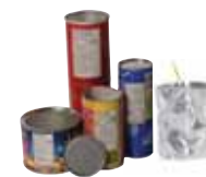
Juice pouches & cardboard cans (frozen juice concentrate cans, potato chip cans & nut cans)